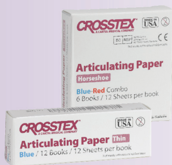
Articulating paper available in straight, curved, curved with tab and horseshoe shaped.