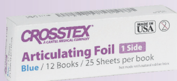
Articulating foil available in single and double sided straight formats.